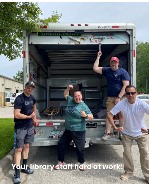
Your library staff hard at work!