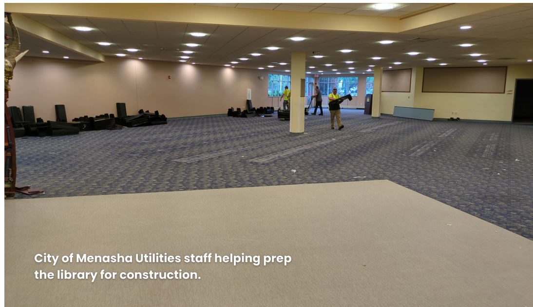
City of Menasha Utilities staff helping prep the library for construction.