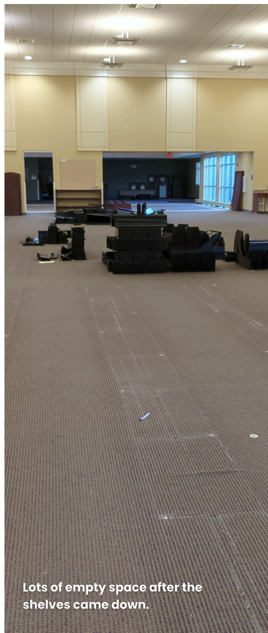
Lots of empty space after the shelves came down.