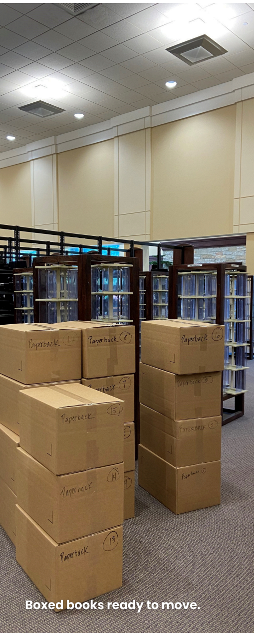
Boxed books ready to move.