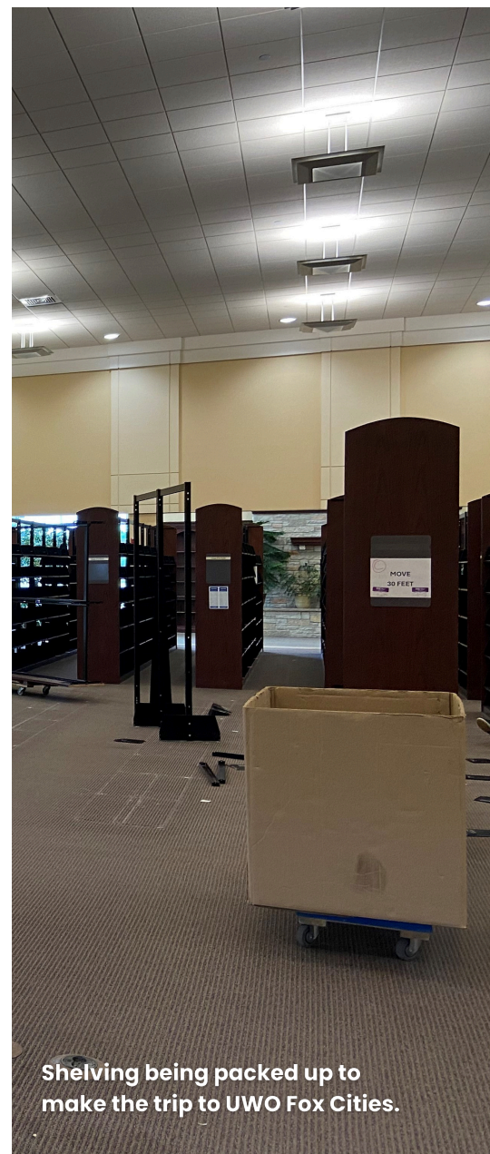
Shelving being packed up to make the trip to UWO Fox Cities.